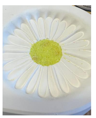
Place Fine Lemon Grass Opal over the Flame Opal.