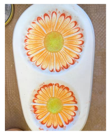
Sift Powder Orange Opal into the bodies of the petals, and Powder Flame Opal onto the edges, as pictured above.