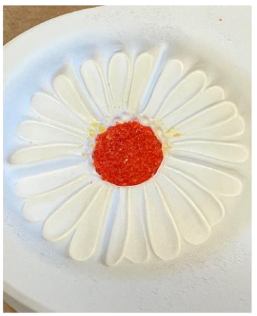
Place Powder Sunflower Opal in the center of the flower, then cover with Fine Flame Opal.