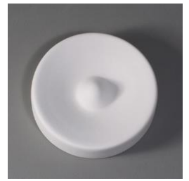
GM 60 Slump with Hump 4" Diameter