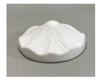
GM 255 Radiant Mushroom Slump 5.5" Diameter