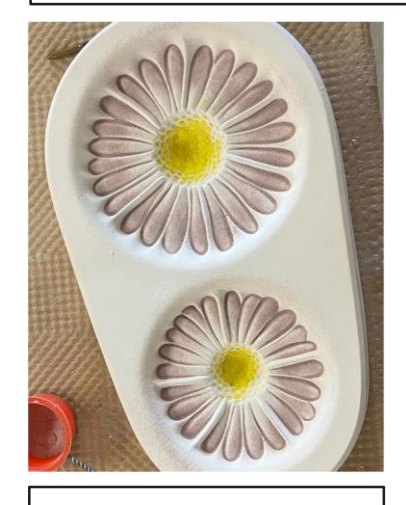
Begin with Powder Sunflower in the centers of the flowers and sift Plum Opal into the petals.