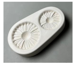
LF 244 Two Coneflowers 9.25" L x 5" W