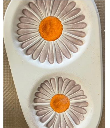
Place Fine Orange Opal over the Sunflower in the center.