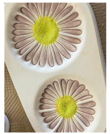
Layer Fine Lemongrass Opal over the Orange Opal.