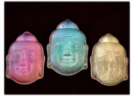
Finished Buddha Faces made with CBS Dichroic on clear sheet glass