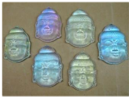
Finished Buddha Faces made with CBS Dichroic on clear sheet glass

Hint: A few very small drops of white glue can be used to keep the dichroic shape in place as the mold is being transported to the kiln.