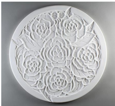
DT20 Round Peony Texture