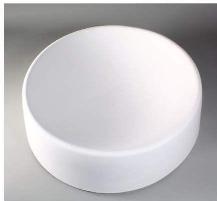
GM125 Patty Gray Large Round Slump