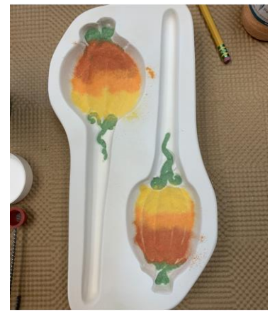
Finish the bottoms of the pumpkins with F1 Sunflower.