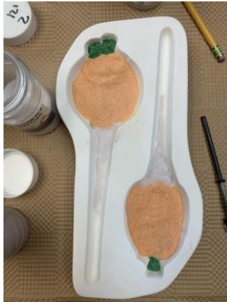
Sift some F1 Pale Purple around the bases of the pumpkins and into the stake.