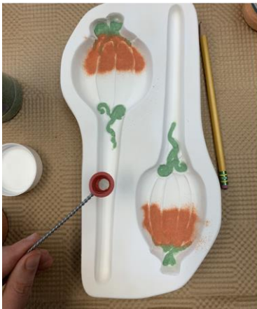
Sift F1 Flame Red into the pumpkins. Avoid going too far into or on top of the vines.