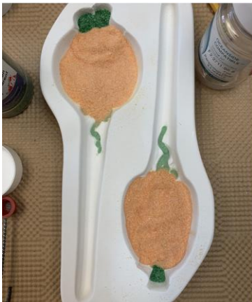
Back the bodies of the pumpkins with a thin layer of F2 Persimmon and sprinkle some F2 Dark Green into the top vines of each.