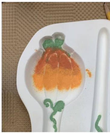
Add the F1 Orange to the middle of the pumpkins.