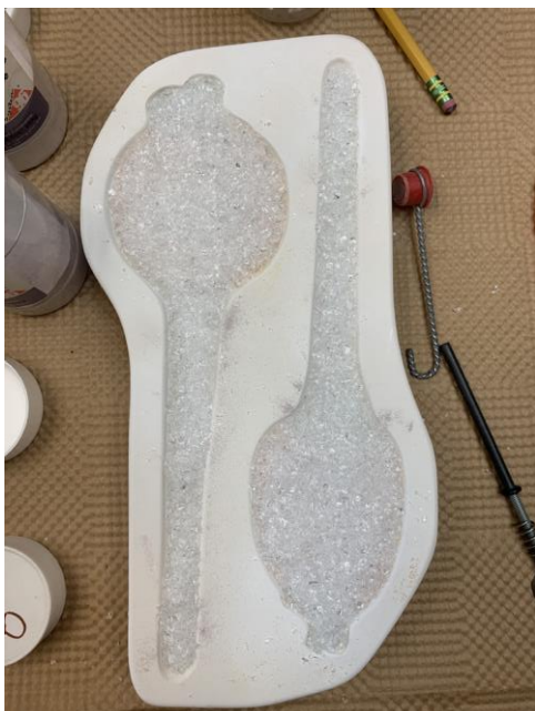
Back both pumpkins with F3 Clear until the total frit weight is around 305 grams (about 135g for the Thinner Pumpkin and 140 for the Wider). Place the mold in the kiln and fire to a Full Fuse using either our suggested schedule in Table 1 , or your own preferred Full Fuse with a bubble squeeze.