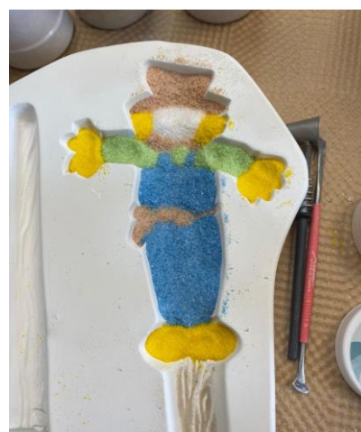
Add F2 Amazon Green to the sleeves. Fill the hat, belt, and scarf with F2 Terracotta.