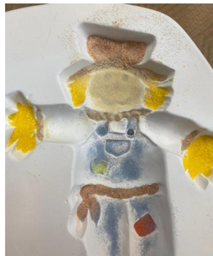
Sift some F1 Medium Amber into the scarecrow's face.