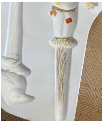
Sprinkle F1 Olive Green down into the stake portion of the mold.