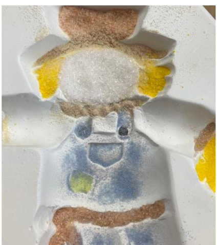
Sprinkle some F1 Navy into the denim overalls, and some F2 Champagne into the face.