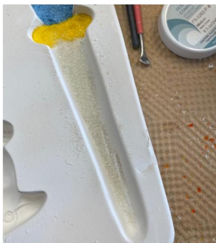
Place some F2 Cloud along the whole stake.