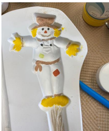
Place F2 Sunflower into the straw hair, feet, and hands, then add some F2 Terracotta into the hat.