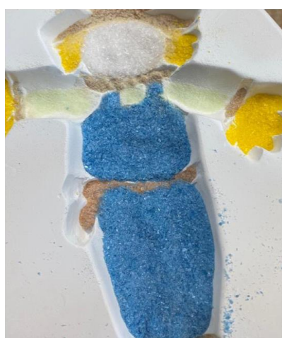
Sift F1 Light Green into the sleeves, and place F2 Mariner Blue into the overalls.