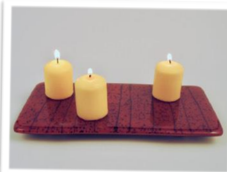
Multiple glass sheets were layered to create a interesting and pleasing design

To give the final piece a crafted look and to protect table top surfaces, apply Bumpons™ or cabinet door bumpers to the finished piece's feet. Apply two Bumpons™ or bumpers to one foot and a single Bumpon™ or