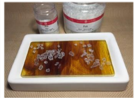
Coarse frit is placed on the top surface to displace the pattern in the sheet glass

Primer™ with a soft artist's brush (not a hake brush) and use a hair dryer to completely dry the coat. Give the mold four to five thin, even coats drying each coat with a hair dryer before applying the next. Make sure to keep the Primo well stirred as it settles quickly. The mold should be totally dry before filling. There is no reason to pre-fire the mold with either primer