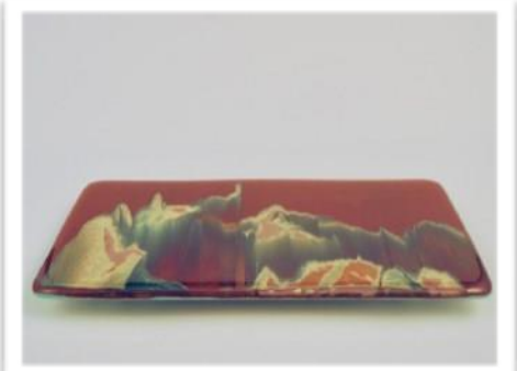
Firing results in a beautiful copper red reaction