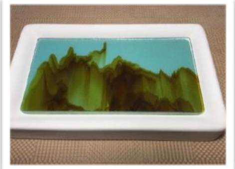
Two sheets of reactive glass - Robin's Egg Blue and Petrified Wood - are combined in the Slab Server Design