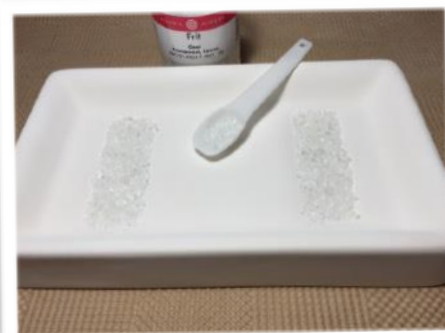
The feet of the Slab Server are filled with coarse frit so the sheet glass melts evenly

6. If the billet does not fit in the mold, cut it into smaller pieces to stack in the mold.