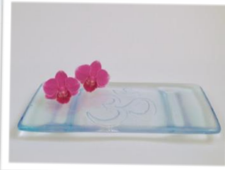
A fiber paper cut-out was placed under the billet piece to create a "kiln carving"

Note: To add extra interest to the design, consider piecing together each layer with multiple glass sheet styles and colors.