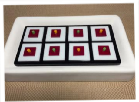
Glass tiles and pieces are stacked to produce playful design. The feet are filled with coarse, black frit

Note: To add extra interest to the design, consider piecing together each layer with multiple glass sheet styles and colors.